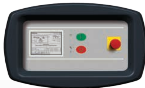
GD TS Pilot