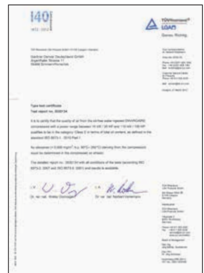
TÜV (Technische Überwachungsverein/Technical Monitoring Association) reporting on the GD range of oil-free water-injected screw compressors.