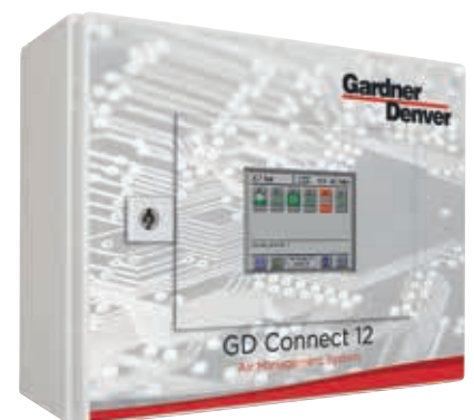
GD Connect 12